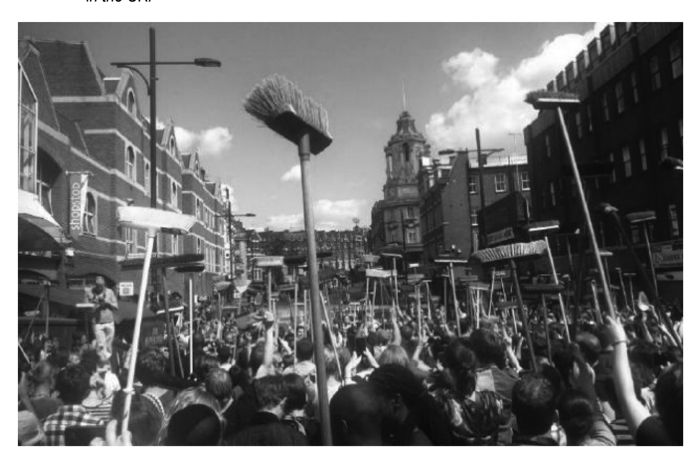
Source E : A photograph published on the BBC news website on 9 August 2011. It shows people who responded to an appeal called #riotcleanup which was organised through social media sites. The BBC is the British Broadcasting Corporation, the main broadcasting organisation in the UK.