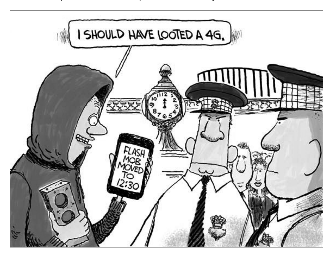
Source A: A cartoon by an American artist, published on 12 August 2011.

The riots have been called the 'BlackBerry Riots' (named after the brand of smartphones, 'BlackBerry') because of the use of social media and networks by rioters to organise violence and theft from shops which had been broken into. Study the following sources to find out whether social media were used to create social disharmony in London in 2011.